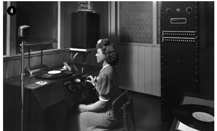
Muzak operator at Troy, NY office, 1942

It could be said that Van Heusen outfitted Main Street and Wall Street for the business booms of the '80s (think contrast collars and suspenders) and when dress codes grew more relaxed in the '90s, they literally wrote the book, publishing Dress Casually for Success ... For Men in 1996, a full-length guide to dressing with authority and comfort, boosted by